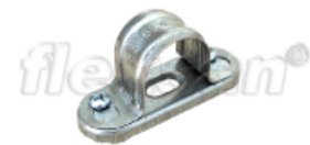
R3840 EMT SPACER BAR SADDLE