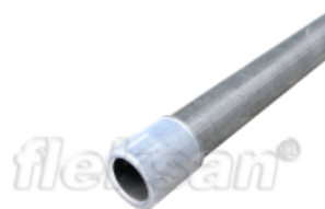
R7790 EMT PIPE CAPS, OPENEND