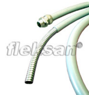
FLEXIBLE CONDUIT, LIQUID-TIGHT GRAY