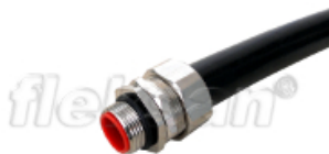
LIQUID-TIGHT CONNECTOR BRASS MALE SWIVEL