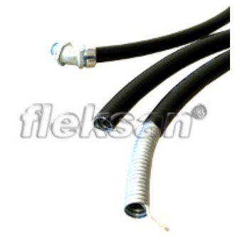
FLEXIBLE CONDUIT, LIQUID-TIGHT BLACK