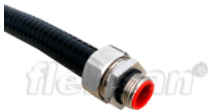
LIQUID-TIGHT CONNECTOR BRASS MALE