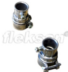
EMT TO FLEX. COMBINATION COUPLING, SET SCREW