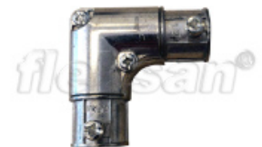
EMT PULLING ELBOW, INSIDE CORNER SET SCREW 90