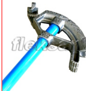
R8000 EMT CONDUIT BENDER