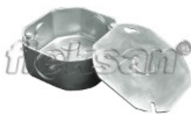
R3680 EMT BOX, OCTAGONAL